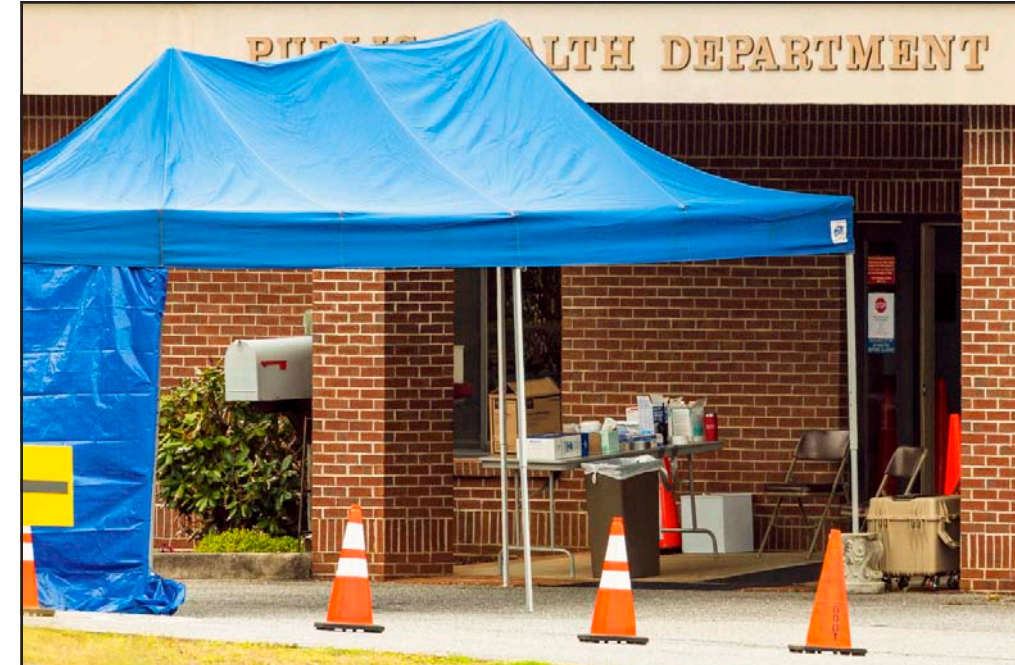
Health care professionals at the Towns County Health Department are testing Union and Towns residents with COVID-19 symptoms every Tuesday and Friday. Call the local health department or a physician for a referral.

By Todd Forrest Towns County Herald Staff Writer