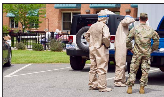
Georgia National Guard troops gearing up to clean the Union County Nursing Home while residents play bingo outside on Thursday, April 23.

Meanwhile, Towns County increased from 13 cases to 20 confirmed cases over the same span and saw a nursing home resident testing positive for the disease.