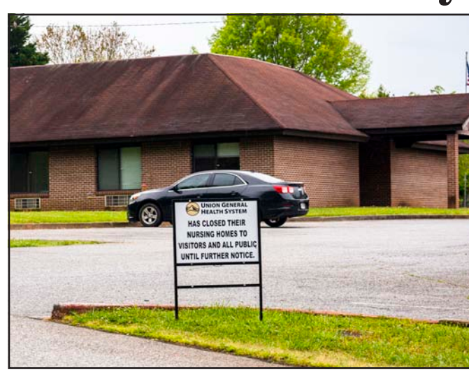
The Georgia Department of Community Health reported on April 24 that a resident of Chatuge Regional Nursing Home had tested positive for COVID-19.

Towns County's Detention Center had 27 inmates as of Sunday, with 16 employees available to work