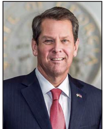
Gov. Brian Kemp

Kemp said he based his decision on several factors, including enhanced testing, "favorable" COVID-19 case data showing a flattened curve, backing by state health care professionals and consultation with President Donald Trump's "Opening Up American Again" guidelines.